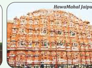
Hawa Mahal Jaipur

VENUE: ICAR-Central Soil Salinity Research Institute, Karnal The Karnal, a pre-historical epic city in state of Haryana, is located 132 km north of Delhi on National Highway No. 1 (i.e. Grant Trunk Road). It is well connected by road and rail. The city is believed to have been founded by King Karna "the all-time great donator" and a key figure of the Mahabharata epic fame, who died at the hands of his brother and arch rival, Arjuna "the greatest archer". Also, it is the birthplace of the first Indo-American woman astronaut Kalpana Chawla who went to space twice; first on the Space Shuttle Columbia in 1997 as a mission specialist and primary robotic arm operator and second time as one of the seven crew members that died in the Space Shuttle Columbia disaster in 2003. More recently, Karnal city was selected as one of the hundred Indian cities to be developed as smart city under PM Narendra Modi's flagship Smart Cities Mission.