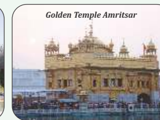
Golden Temple Amritsar