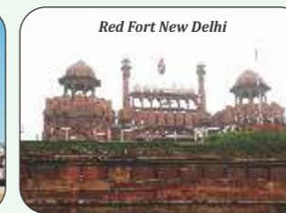
Red Fort New Delhi