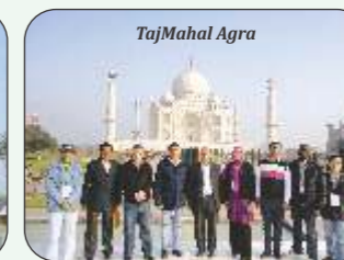
Taj Mahal Agra