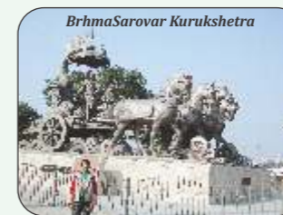
Brhma Sarovar Kurukshetra